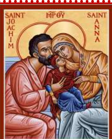
St Joachim and St Anne

Mary, Mother of all the living , keep grandparents constantly in your care, accompany them on their earthly pilgrimage, and by your prayers, grant that all families may one day be reunited in our heavenly homeland, where you await all humanity for the great embrace of life without end. Amen.